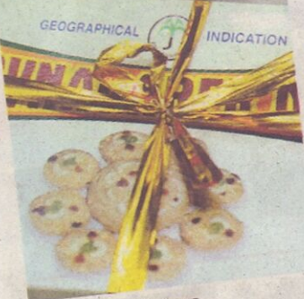
A packets of moas with GI patent mark